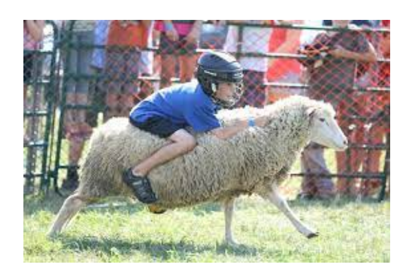
Sheep Racing at the Port Perry Fair — Labour Day Weekend